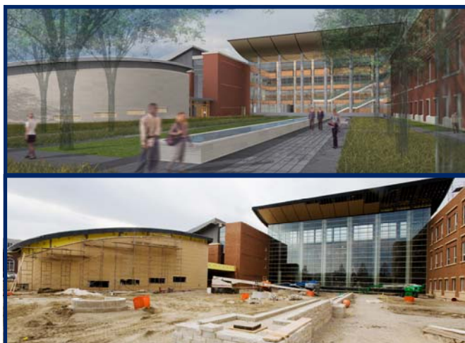
A comparison of the architect's rendering and construction photo of the Business Instructional Facility, scheduled to open for class on August 25, show the building's progress.

As the 2008 school year comes to a close, progress on the construction of the College of Business's new facility nears completion. The Business Instructional Facility's grand opening ceremony will be held on October 17 at 1:30 p.m. and will be followed by a reception. However, the building will be ready to hold class when students return to class on August 25, 2008.