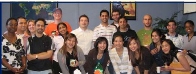
The Women in Business society held their Farewell Coffee Club on April 23.

WiB would like to thank all of the second-years for their hard work and dedication. We will miss you but know you will go far. WiB looks forward to yet another exciting school year in 2008-2009 as a new class of MBA students joins the IMBA community.