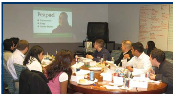
Students of the E-Commerce class enjoy lunch while learning Peapod's business model.