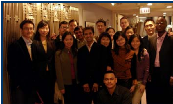
Graduate Finance Association members kicked off Spring Break with an educational trip to Chicago.

overview of the value of the CFA designation and highlighted benefits available to student members. The majority of the time was spent networking with the members of the CFA Society present including CFA Society board members. Overall, the day of activities was a success and the GFA hopes that this will now be a yearly event on the GFA calendar.