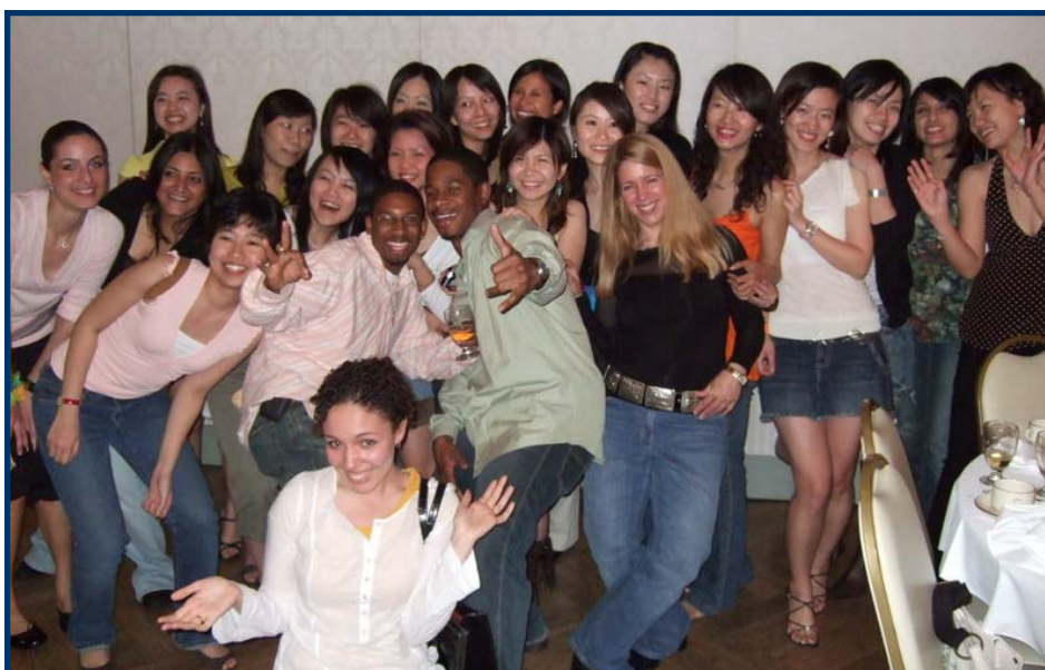
It was a night to remember for these second-year students. Finale allows soon-to-be graduates to reflect on and celebrate their Illinois MBA experience.