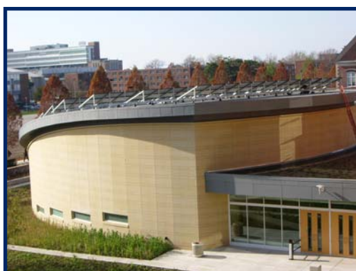
Pictured here, the solar panels and drought-free rain garden on the Business Instructional Facility’s roof are two of the new green building’s many sustainable features. The new facility uses 50% less energy than a comparably sized building.