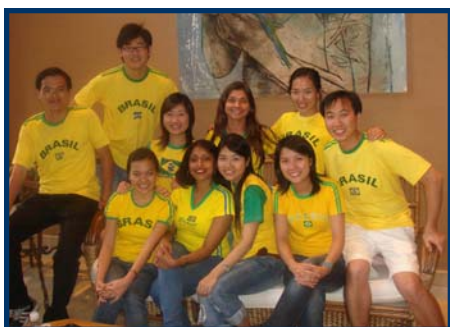
MBA students display their enthusiasm by sporting yellow and green Brasil t-shirts.

More than 50 Illinois MBA students studied abroad in sunny São Paulo, Brazil, over the winter break at the Universidade de São Paulo and FIPE (Fundação Instituto de Pesquisas Econômicas). And several preceded their arrival to São Paulo with a